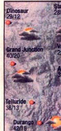
Shown is today's forecast. Fr